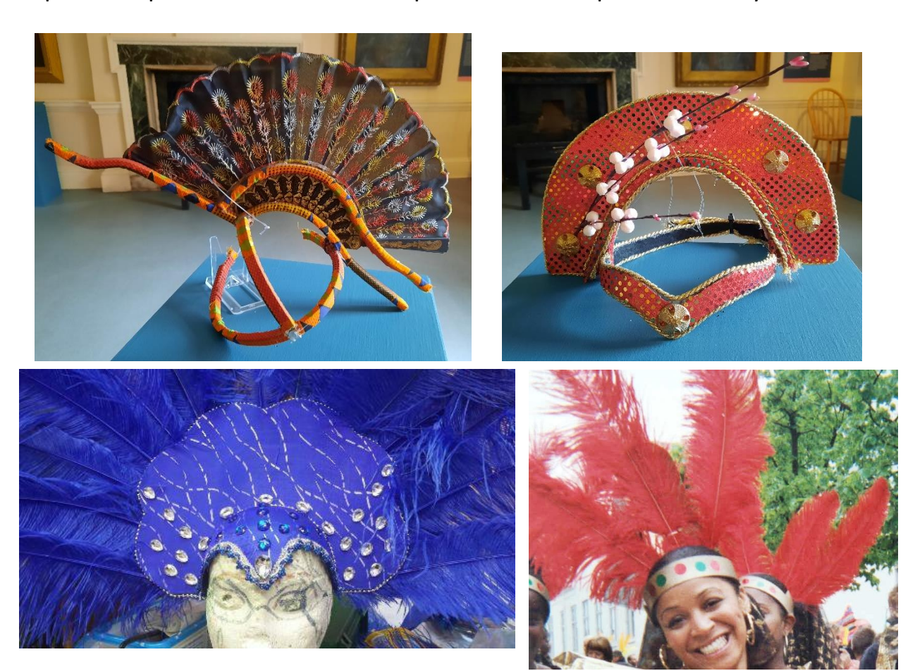
Headdress' by People's World Carnival Band.

Explore the pictures of Carnival headpieces and be inspired to make your own.