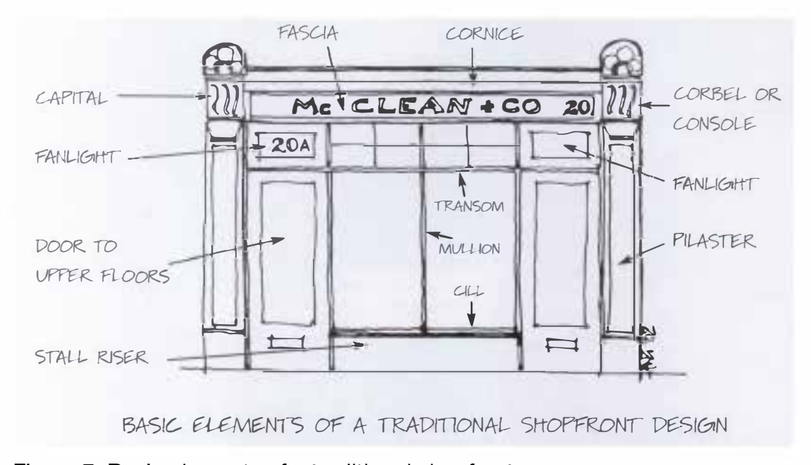
Figure 7: Basic elements of a traditional shopfront

A doorway, which may be either centre or side positioned and will often be recessed. If there is a separate door to the upper floors this should be maintained.