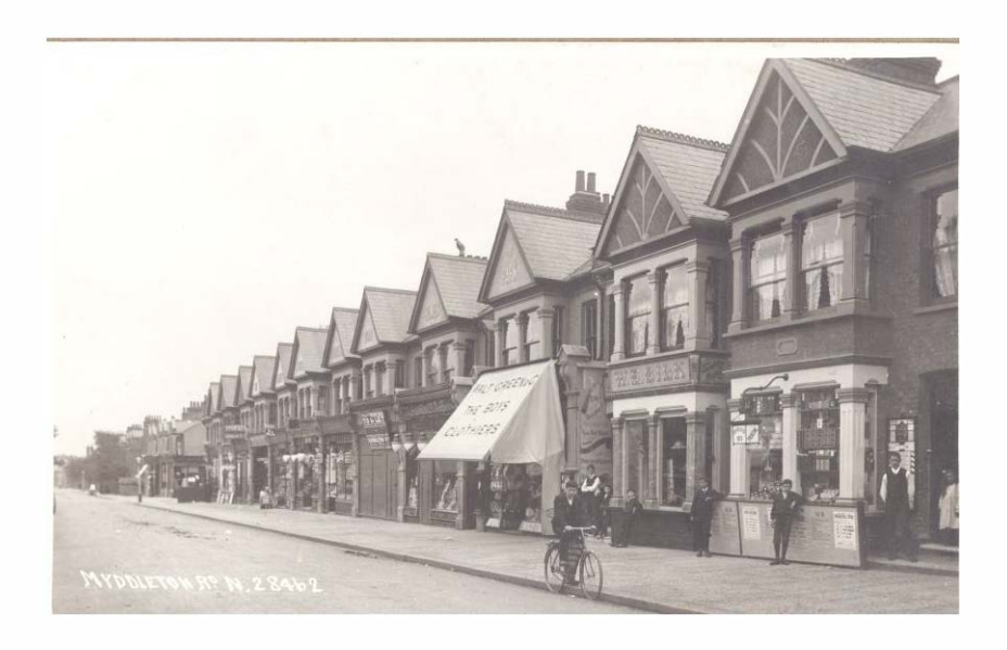
Figure 2: Terrace on south-side of Myddleton Road, circa. 1902

semi-private enclosed garden as can be seen in Fig. 1. Rooms at street level on the ground floor were occupied with basic shop units and converted to shopfront by the early 20<sup>th</sup> century on the south-side of the street, nos. 69-109. The original front fenced gardens disappeared allowing the street to assume a more commercial appearance.