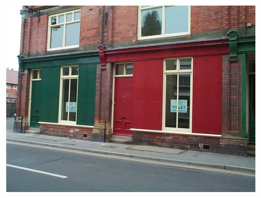
Figure 11: A shopfront converted to residential – solid panels that look like traditional external shopfront shutters, Wem, Herefordshire

5.2.7 As part of the design, it is expected that openable windows or trickle vents will be incorporated to allow residents to get user controlled, natural ventilation, located only in the fanlight / toplight zone . This helps preserve privacy and reduce noise whilst allowing fresh air. Windows or louvres must be capable of being left safely to allow controllable background ventilation when the property is unattended.