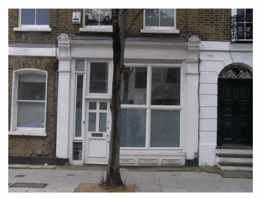
Figure 9: Wintergarden behind retained shopfront – a shop converted to residential, with wintergarden and obscured glass, Islington