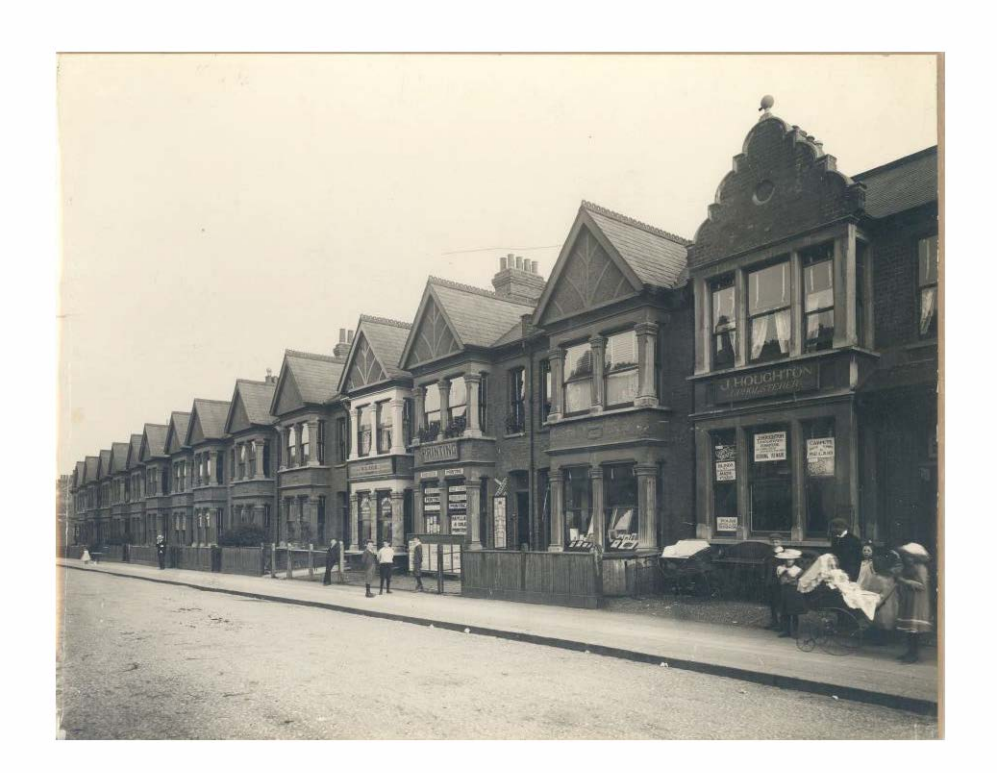
Figure 1: Terrace on south-side of Myddleton Road, circa. 1899

2.1.5 Photographic evidence of commercial activity along Myddleton Road shows that originally the front rooms of houses were used for commercial purposes. Shop units were initially contained within this residential format with narrow,