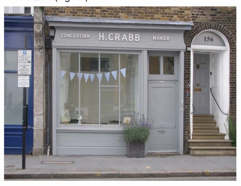
Figure 8: Zone Behind Shop Window – a Place for Art. A shop converted to residential, with a small space for art, Islington