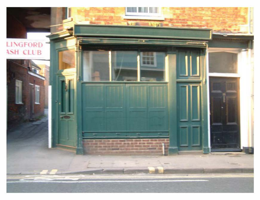
Figure 10: Traditional shutters, Wallingford, Oxfordshire