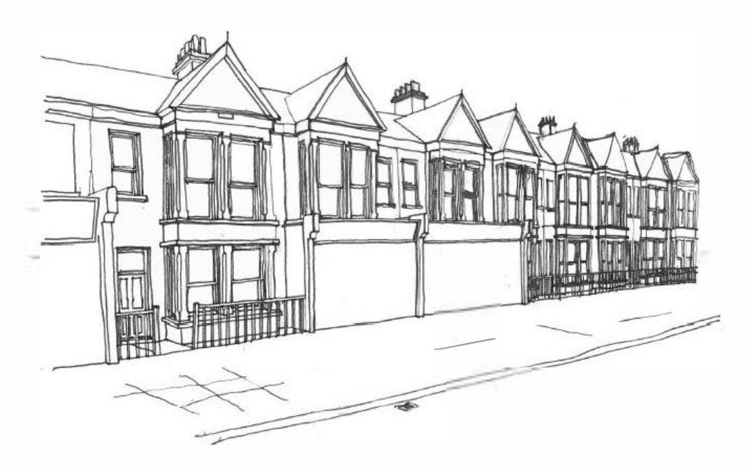
Figure 12: Terrace in transition from added on retail to return to residential

5.2.22 Fig. 12 below demonstrates the design tension of some properties converted to residential, with some plots still having shop units.