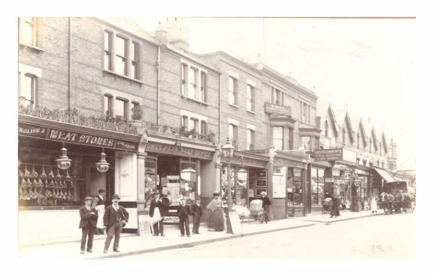
Figure 3: Terrace on south-side of Myddleton Road, circa. 1903

2.1.6 By the beginning of the twentieth century, the fabric of the street had altered significantly with a number of purpose-built shopfronts extending out onto the street, evident in the rest of the street. Over time, the development of retail in Myddleton Road has created the commercial characteristics of the local shopping centre that exists today. The extension of the electric tramline through to Bowes Park had encouraged further growth in the area and by 1912 there were 80 shops in existence.