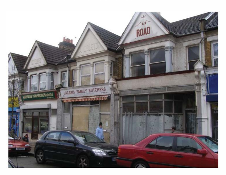
Figure 4: 91-95 Myddleton Road today, south-side