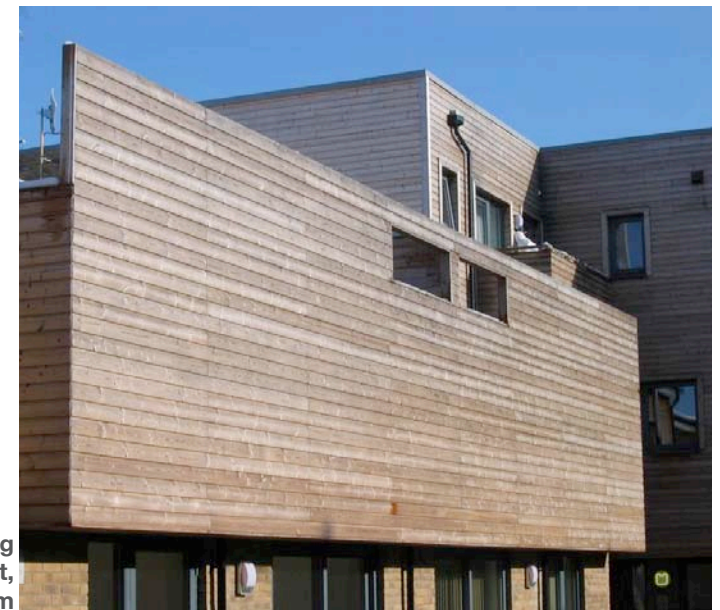
Timber cladding at Silver Court, Tottenham