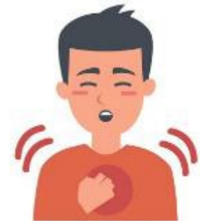
CHEST PAIN OR TIGHTNESS