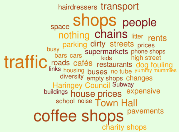
Q2 What do you dislike about Crouch End?