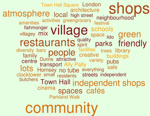
Q1 What do you like about Crouch End?