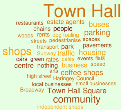
Q3 What would you change?