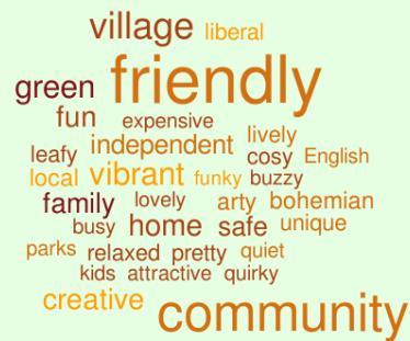
Q4 Three words that describe Crouch End?