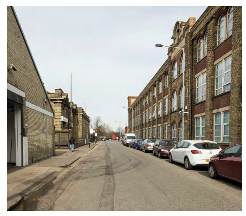
Ashley Road South

As a public authority, the London Borough of Haringey is subject to the Freedom of Information Act 2000 (the Act). All requests made to Haringey Council for information with regard to the Quality Review Panel will be handled according to the provisions of the Act. Legal advice may be required on a case by case basis to establish whether any exemptions apply under the Act.