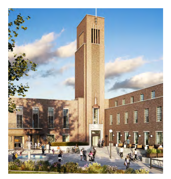
Hornsey Town Hall, Make Architects

By offering advice to applicants during the preapplication process and by commenting on planning applications, the Quality Review Panel supports Haringey's planning officers and planning committee in securing high quality development.