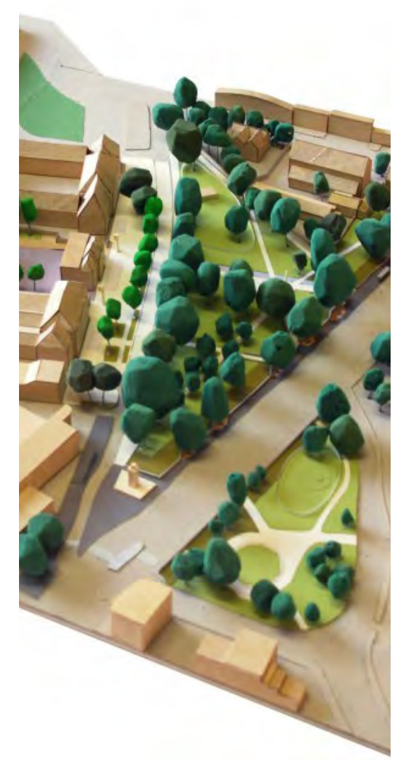
Tottenham Green, Adams & Sutherland for Haringey Council Haringey Design Award 2016 - Best Place or Landscape

A surgery review will be summarised in a brief document no more than two sides of A4, rather than a full report.