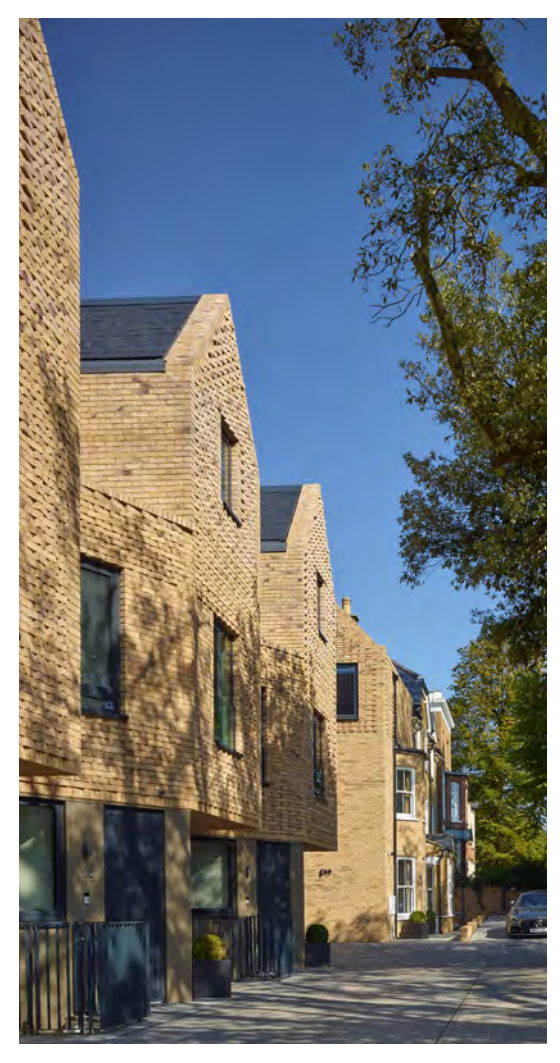
Beacon Lodge © pH+ Architects

https://www.london.gov.uk/sites/default/files/ ggbd_london_design_review_charter_jan22.pdf