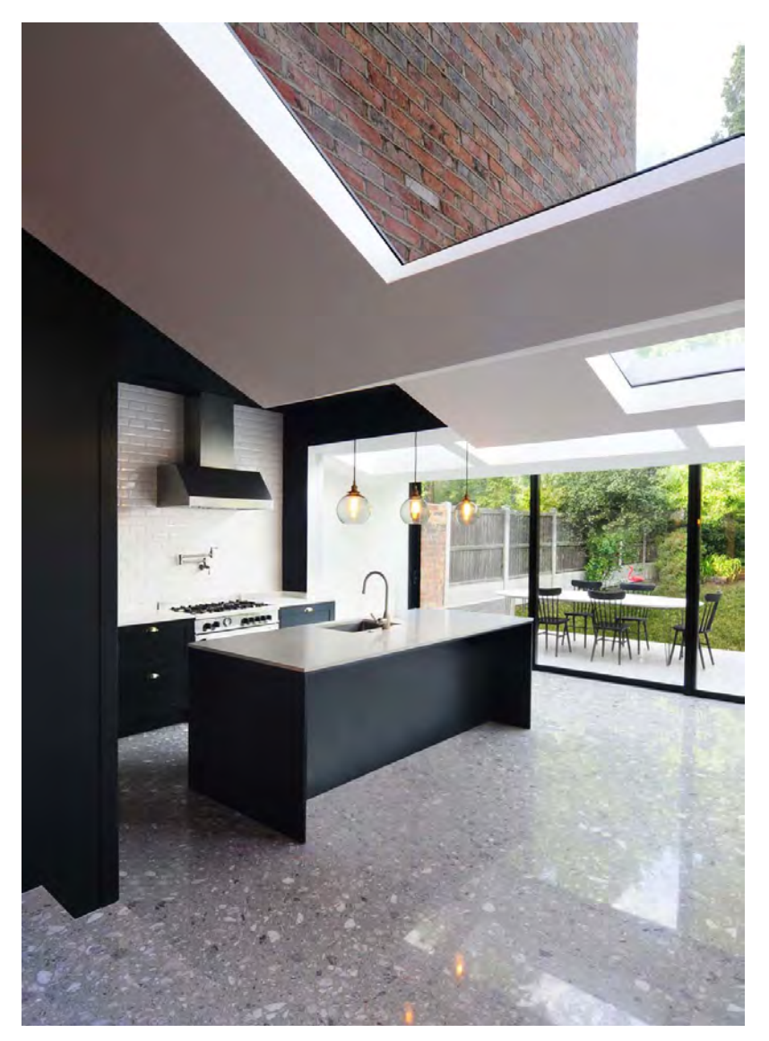
Folds House, Bureau de Change Architects, Haringey Design Award 2016 - Best House / British Homes Award 2016 - One-off House or Extension