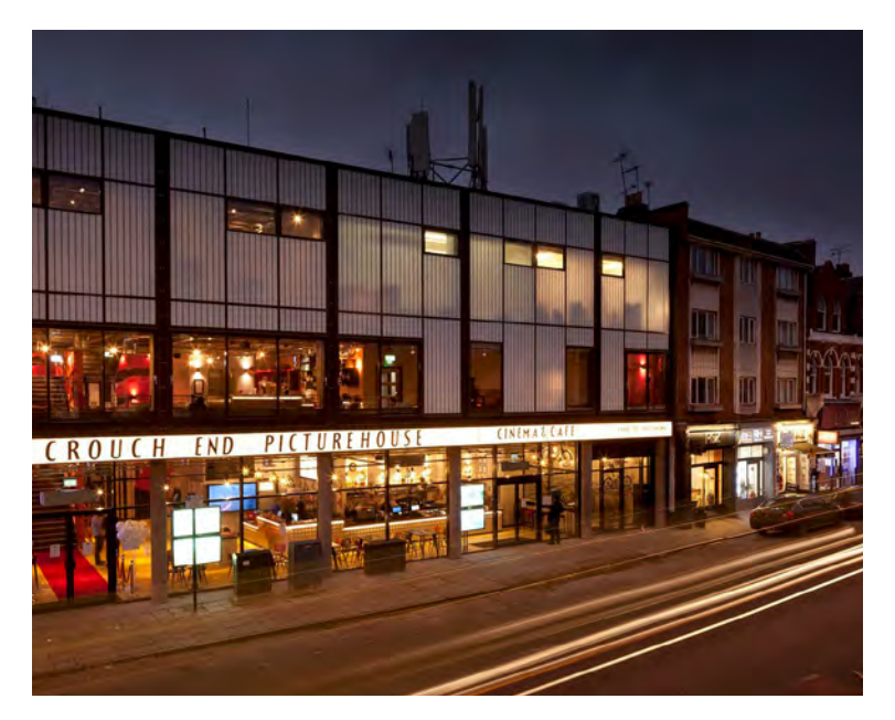
Crouch End Picture House, Panter Hudspith Architects Haringey Design Award 2016 - Best Green Design

As part of this annual review process, a meeting will be held with key Haringey Council officers and the panel chair to discuss the report and consider any recommendations for the following year.